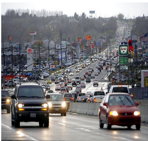
Riverdale Road in Ogden Utah.

Riverdale Road is a congested non-freeway corridor in Ogden, Utah (see photo below) that carries about 47,000 vehicles a day. Commercial activity in the corridor is significant with shopping areas on both sides of the road for large portions of the corridor, especially on the western side, gradually reducing in density west to east. This segment is primarily a 6-lane road with 11 traffic signals.